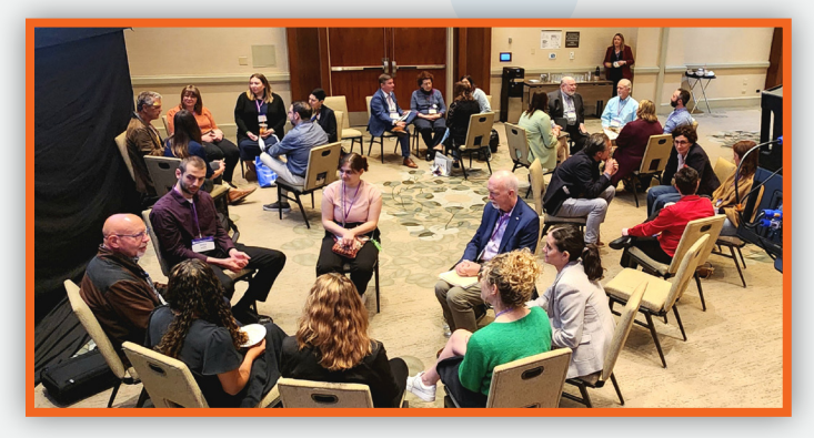
Participants brainstorm ideas about how best to support the TA community.